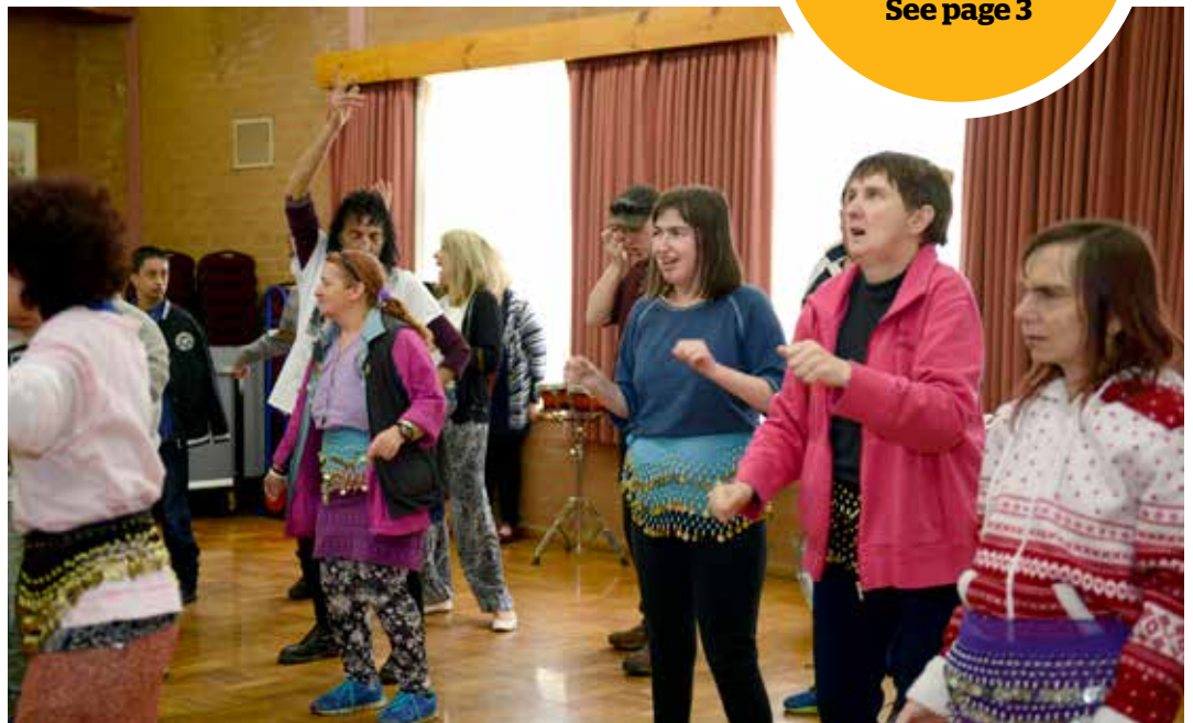
Images of the rehearsals for our 2016 concert.

Please fill out our survey How do you want to be communicated with? See page 3